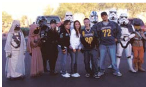
The force was with El Dorado High School, as 65 representatives from the school walked for a cure.

More than 225 Leona participants joined tens of thousands for the Multiple Sclerosis Society "Walk on the Wild Side," Saturday, Nov. 8, 2008. The event, which raises money to find a cure for Multiple Sclerosis, included walks along three- and five-mile paths leading through the Phoenix Zoo and the Desert Botanical Garden.